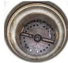
ACCEPTABLE!! Good to Go!