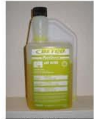
PH 7 for Cleaning Floors