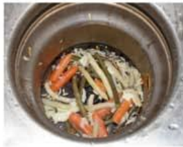
NOT CLEAR!! Needs to be run more!!