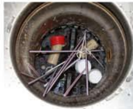
NOT ACCEPTABLE!!! Please Remove!!!